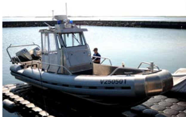
The boat used by the GAs is a 27-foot safe boat, so named because the foam siding around the boat prevent it from sinking or capsizing.