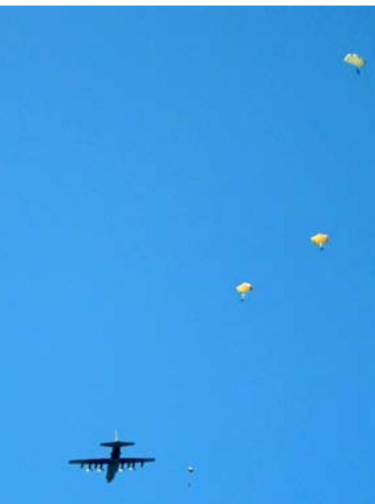
Above & right: The RAMZ kits and GAs are both deployed from an HC-130 operated by the 102nd RQS. The HC-130 crew is assisted in identifying the dropzone by the boat party.