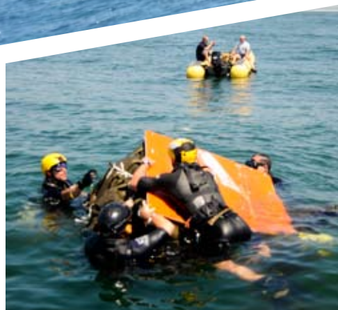
GAs gather at a RAMZ kit after their jump and get the zodiac under way.

While some might see a sunny Saturday on a boat as a nice break from the office, for the Guardian Angels (GA) of the 103rd Rescue Squadron, 106th Rescue Wing, from F.S. Gabreski Airport (ANG), Westhampton Beach, N.Y., it is anything but a break. On August 1, 2009 GAs arrived at the U.S. Coast Guard station in Hampton Bays, N.Y. to pick up their 27-foot safe boat, so named for its inability to capsize or sink. Other watercraft that the GAs use include: the Advanced Rescue Craft, more commonly known as a Jet Ski or Wave Runner, and the zodiac, an inflatable boat. The day's events weren't just focused on the GAs though; the training mission was a coordination of effort between the HC-130 aircraft of the 102nd Rescue Squadron, which deploy the GAs and the Rigged Alternate Method Zodiac (RAMZ) kits, and the HH-60 helicopters of the 101st Rescue Squadron, which conducted the Alternate Insertion and Extraction training with the GAs.