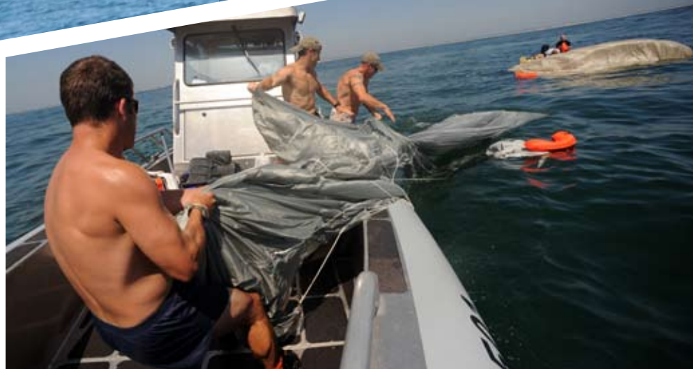
GAs on the boat retrieve the parachutes after the jump. Riggers from the 106th Operation Support Flight will rinse, dry and repack the parachutes so that they will be ready for the next jump.

After parachuting from the HC-130 and landing in the water, the GAs de-