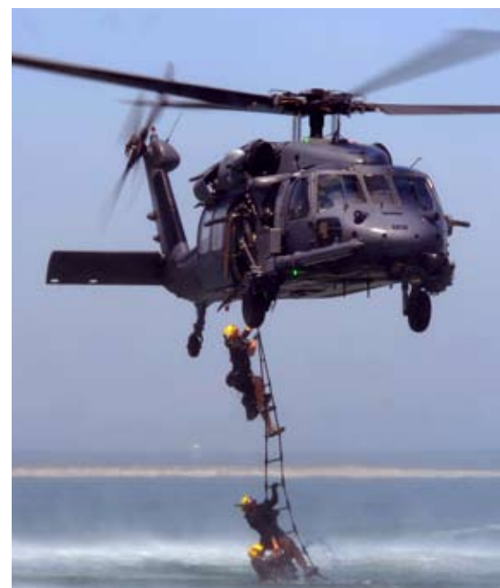
GAs climb a rope ladder to a waiting HH-60.

the training in a debriefing. For the GAs, the crews of the HC-130s and HH-60s, this kind of training is vital in ensuring the 106th Rescue Wing can accomplish its primary mission of Combat Search and Rescue.