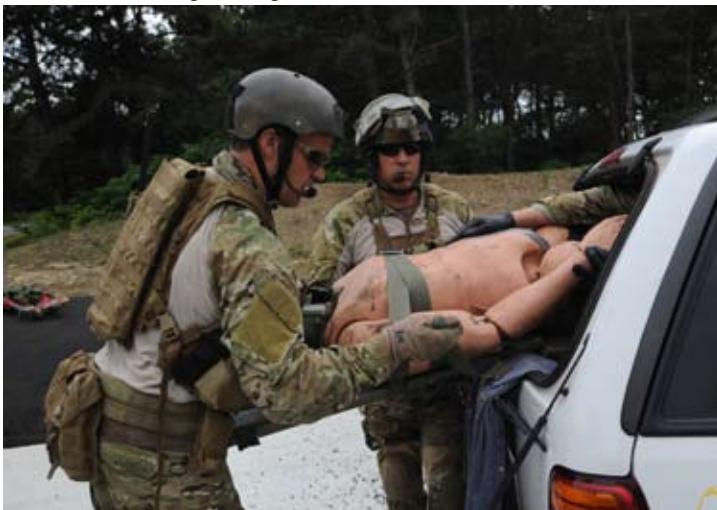
Guardian Angels from the 103rd Rescue Squadron participate in a rescue training scenario at the Hagerman Fire Department, in Patchogue, N.Y., on June 25, 2009.